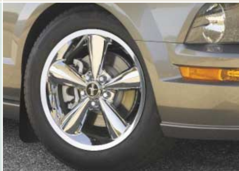
Custom Wheels. These new Mustang 18" wheels rock...and keep you rolling in style. You'll find a great selection of custom-designed wheels on page 6.