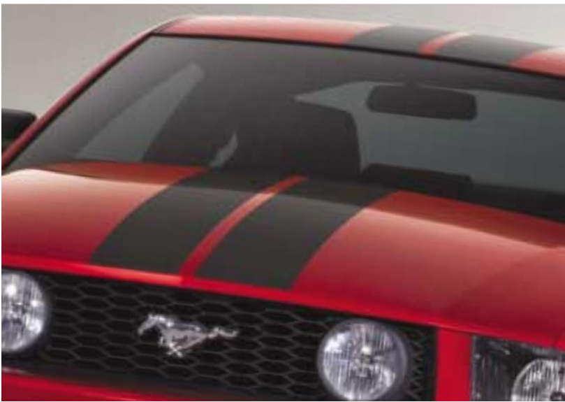
Racing Stripes. Add sporty style by personalizing your 'Stang with this best-selling kit. See page 5 for details.

Turn the page and discover a complete catalog of great choices to help you personalize your new Mustang. Engineered by Ford for a perfect fit and long-wearing durability, Genuine Ford Accessories click with the image of your American dream car: they're sportive, spirited and ultimately stylish. What's more, you can rely on precise professional installation at your Ford dealer and the backing of one of the industry's strongest limited warranties.