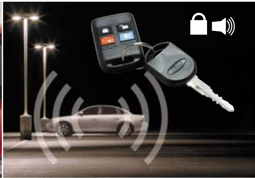
Vehicle Security System. On page 7, we offer products that are designed for your convenience and protection. This popular, state-of-the-art system protects your vehicle and its contents.