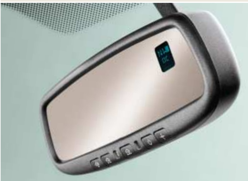
Electrochromic Mirrors and Electrochromic HomeLink® Mirrors. These top-selling mirrors eliminate headlight glare, plus much more! See page 6 for more details on their state-of-the-art features.